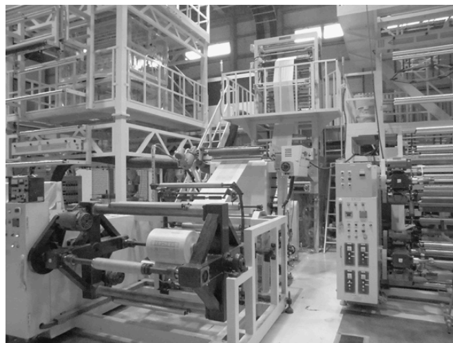
Figure 2: Film-forming machine