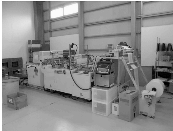
Figure 3: Cutting machine

In the cutting process, the vinyl roll is cut by a cutting machine into a single bag according to the design specified by each municipality (Figure. 3), and an operation is performed to fold the vinyl roll every specified number of sheets. In the cutting process, it is necessary to adjust the cutting position and the attachment and detachment of the vinyl roll at the time of switching of the items. Furthermore, it is necessary to adjust the cutting position even during production. Table 3 shows the time required for starting up and shutting down the cutting machine. Because the start-up/shut-down time is less than the film-forming step, switching is frequently performed compared to the film-forming process. However, as in the film-molding process, the worker stops and adjusts the machine and the worker will be forced to make a decision as to whether to make fine adjustments during the manufacturing despite the occurrence of losses.