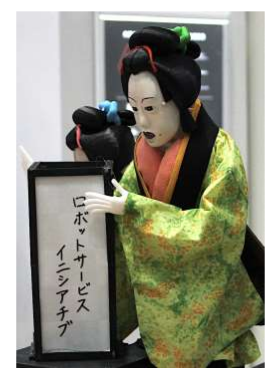
Figure 1 OSONO exhibited at International Robot Exhibition 2019, TOKYO, JAPAN

*Note: Joruri puppet theater is traditional Japanese puppet show registered as a UNESCO Intangible Cultural Heritage, sometimes called as "Bunraku". Most of Joruri puppets for Joruri Puppet theater were made in the middle of the Edo period and the Meiji era about 1700-1900[1]