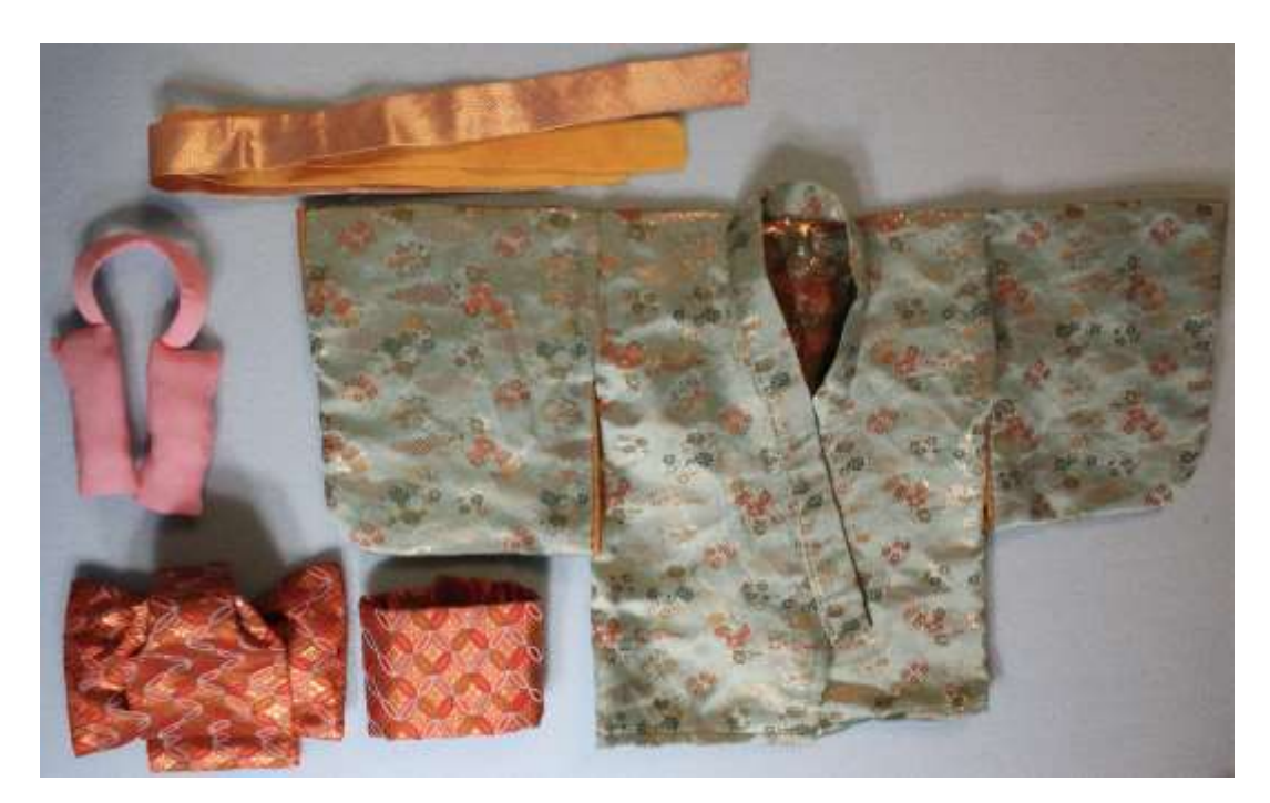
Figure 6: OSONO's kimono parts

On the hair design, the hair style is an effective means of expressing diversity. By preparing various hair styles and attaching them to the head, it is possible to provide a variety of models from modern times to the 1600s Edo period. For OSONO, we selected a typical hairstyle "Tsubusi