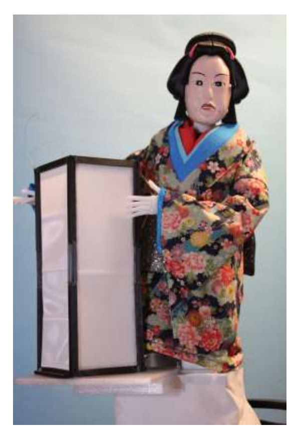
Figure 7: extended OSONO with 4 FOD

In Tables 1 and 2, many of the respondents feel that the quality of OSONO's choreography is good. On the other hand, regarding the number of actuators, in the actual robot, there is no