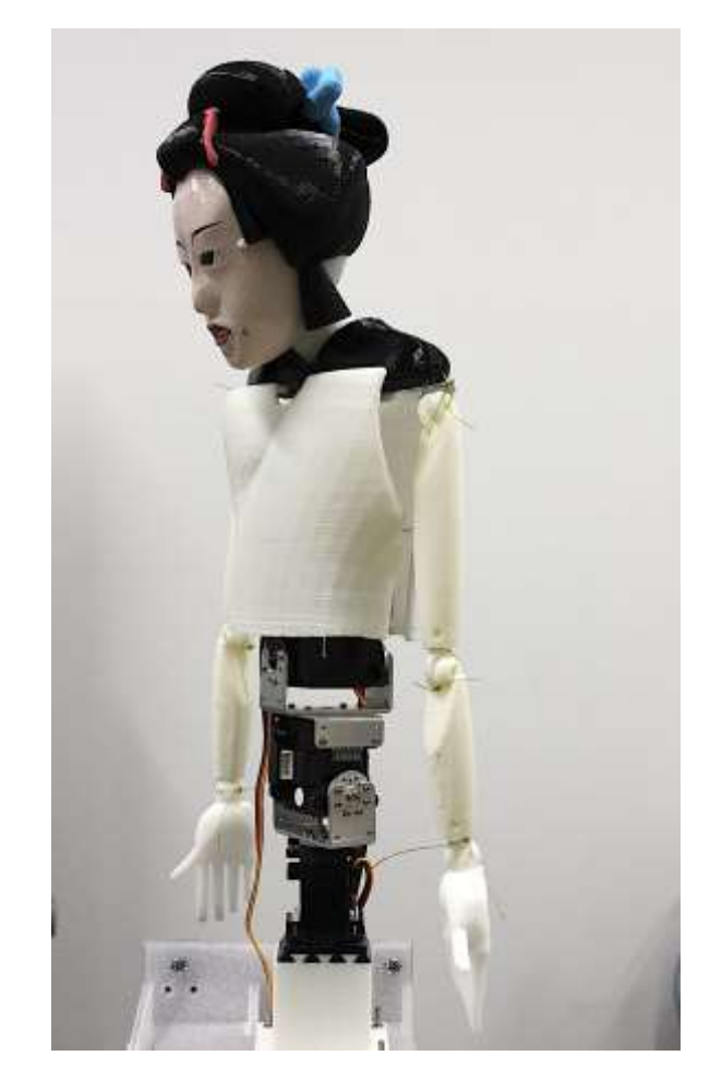
Figure 5: OSONO's robot body and 3 actuators at the waist for its torso

As for an implementation, OSONO is 39cm tall. It's active-joints were implemented by PWM servo motors. Particularly, to rotate and tilt the torso, we used servo motors with 48.0kg cm torque. One Arduino UNO board connected to the servomotor, which controls the choreography and the